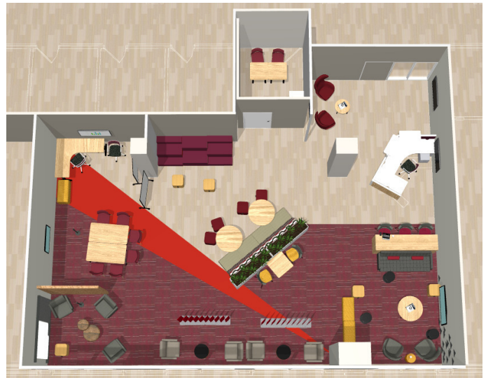
» Adobe Digital Lounge Design Rendering

The University Libraries are revamping existing services and introducing new services during the upcoming academic year. This fall, we will merge two service desks on the second floor into one combined service point. We anticipate this new single service point will better serve library users. Also new this fall is the Adobe Digital Lounge. This dynamic space is designed to foster creativity and help students and faculty connect with others and get support using Adobe tools. In Spring 2022, we will launch a pilot program,